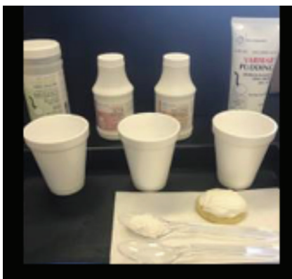
FIGURE 2. Sample of a standardized, clean, efficient tray set up.

tuted with water), which contains rice starch and has been shown to be equivalent to IDDSI Level 1 (Slightly Thick). 38 If IDDSI Level 1 (Slightly Thick) is not sufficient to achieve safe and efficient oral intake, and thicker IDDSI Levels (Mildly Thick IDDSI Level 2 or Moderately Thick IDDSI Level 3) are shown to significantly improve oropharyngeal swallowing function, the clinician must use clinical testing methods, such as the IDDSI Flow Test, to determine the appropriate thickener-to-formula ratio to match the IDDSI Level that was determined to be safest under MBSS. Note that when mixing formula with commercially available thickening agents, a number of factors have been shown to influence the resulting thickness, including: the type of thickening agent used, the base fluid (formula) characteristics, the amount of base fluid, the temperature of the formula at mixing and at serving, the sit time (time from preparation to consumption), and the method of mixing the thickening agent into the fluid (i.e., shaking, stirring, and/or immersion blending). 22,37